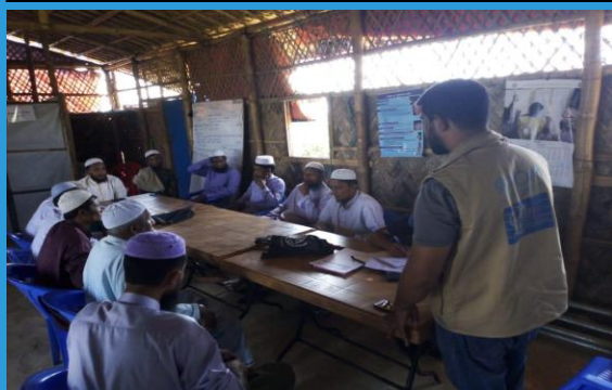
Stakeholder meeting with Imam

RTM International is working closely with the Government of Bangladesh (GOB) departments for logistics support for family planning, MCH, COVID 19, GBV and referral services in implementing the project activities. Technical assistance and collaboration from GOB (DDFP, CS) and other concerned stakeholders UNHCR, UNICEF, UNFPA, IOM, and Pathfinder International has been mobilized based on project needs. RTMI also attended routine coordination meetings organized by different government departments (RRRC, DC, CS, and DDFP Offices in Cox's Bazar) and Health Sector Coordination groups as they play the regulatory/monitoring roles. During implementation of the project, efforts have been made to ensure capacity building of the project staff, team spirit among all staffs, particularly CHVs and their Supervisor for successful planning, conduction of household visits.