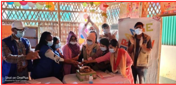
Celebrated 500 th delivery service at Camp-19 PHCC while IOM representatives were present at the program.

RTMI is a nationally recognized non-profit resource organization registered as an NGO in 1994 with the NGO Affairs Bureau (NGOAB) providing technical, managerial and support services in health, education, nutrition, post disaster management, humanitarian response and other development program.